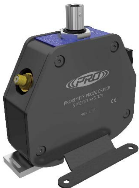
Panel Mount Option (Shown Above)