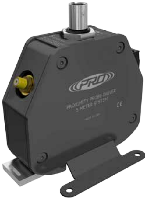
Panel Mount Option (Shown Above)